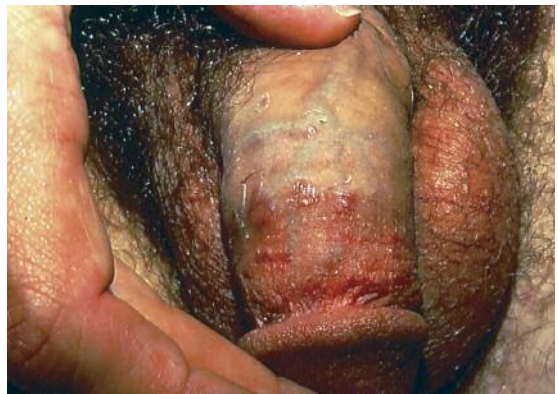
Figure 2. Penile bowenoid papulosis lesions. Such lesions can be mistaken for genital condyloma.

There are a variety of patient- and physician-applied treatments for condylomas, though no treatment is 100% effective.