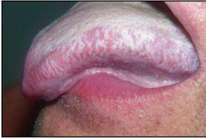
Figure 7. Oral hairy leukoplakia.