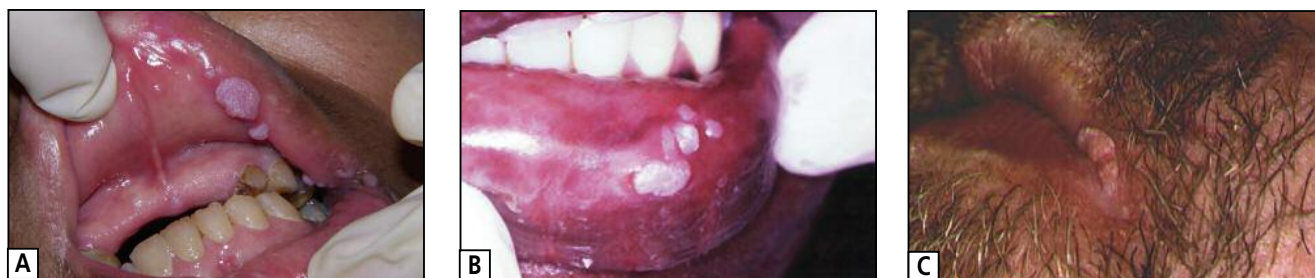
Figure 6. Oral condyloma (A), oral condyloma on the lower lip (B), and external lip condyloma (C).

As knowledge of the HPV vaccine in US communities grows, MSM are increasingly interested about the possibility of being vaccinated. More than 93% of one surveyed group said they would be willing to disclose their sexual history to receive vaccination. 44 Other attitude assessments have determined that young