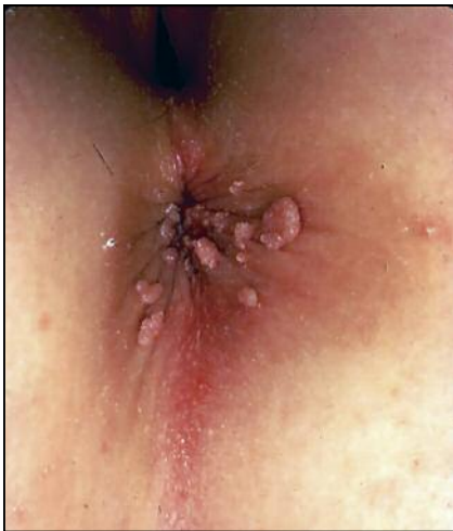
Figure 8. Anal condyloma. Reprinted with permission from John C. Hall, MD.

male patients are more willing to be vaccinated if their healthcare provider emphasizes the high prevalence of HPV infection in their communities and the vaccines' threat to their own health more than the patients' risk of transmitting HPV infection to others. 45 A review of the literature shows that acceptance of the HPV vaccine for males is generally high among physicians and patients, but patient acceptance is highly dependent on physicians' offering the vaccine first. 19,46