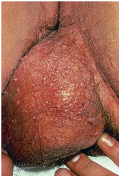
Figure 1. Genital condyloma on a scrotum.

The CDC reports that only 1% of sexually active men have visible genital warts at any given time, yet if advanced antibody testing methods are used, up to 73% of healthy men have detectable HPV in the external genital tract. 6,16 Genital warts (condyloma acuminatum, venereal warts) are a common symptom of infection with HPV-6 or HPV-11. 20 Even though condyloma-associated HPV strains 6 and 11 are considered low risk because of their nononcogenic nature, they are still transmissible, incur costs of frequent treatment, and have emotional costs to patients. 19 Both HPV-6 and HPV-11 can cause recurrent respiratory papillomatosis, an uncommon condition in which condylomas develop in the throat, potentially blocking the patient's airway. 6,12